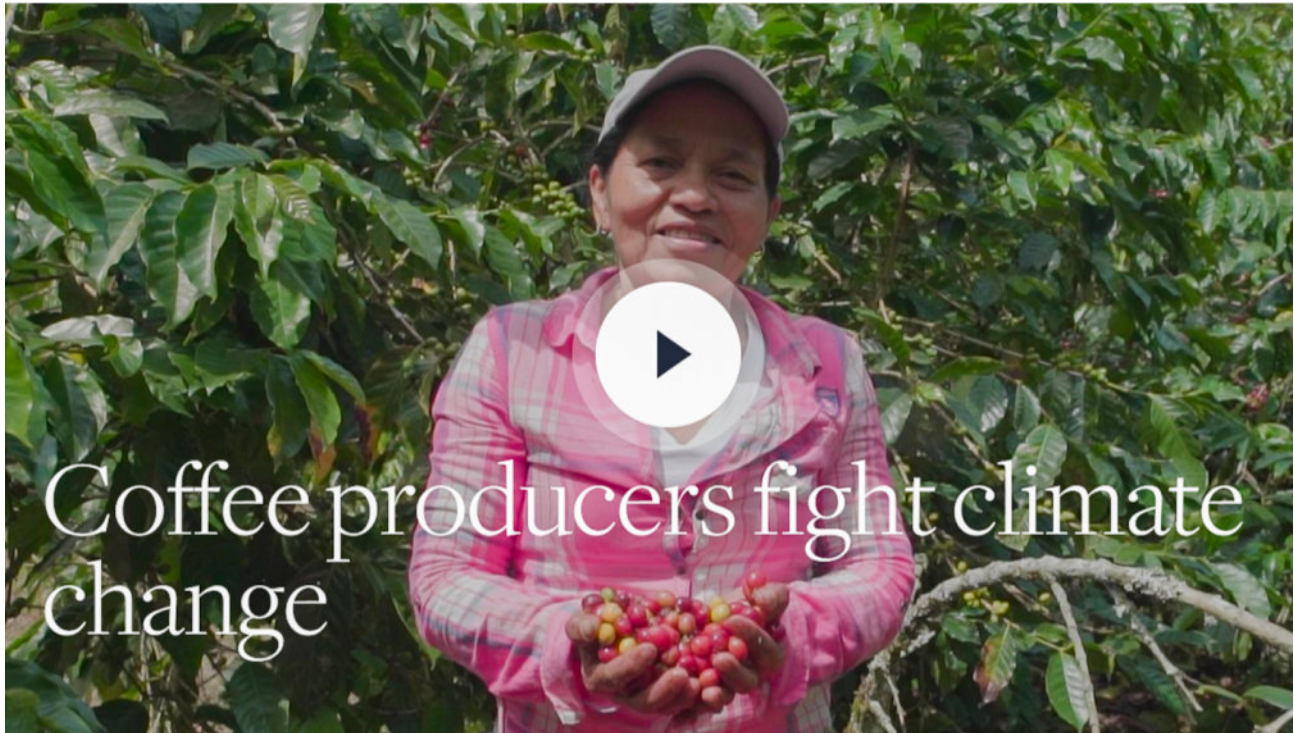
Video: Climate solutions in action: ACORN platform enables farmers to capture and trade carbon emissions.

without the Acorn initiative powered by Rabobank. Together we have ambitions to connect 3 million smallholder farmers to carbon markets in the course of the next decade.