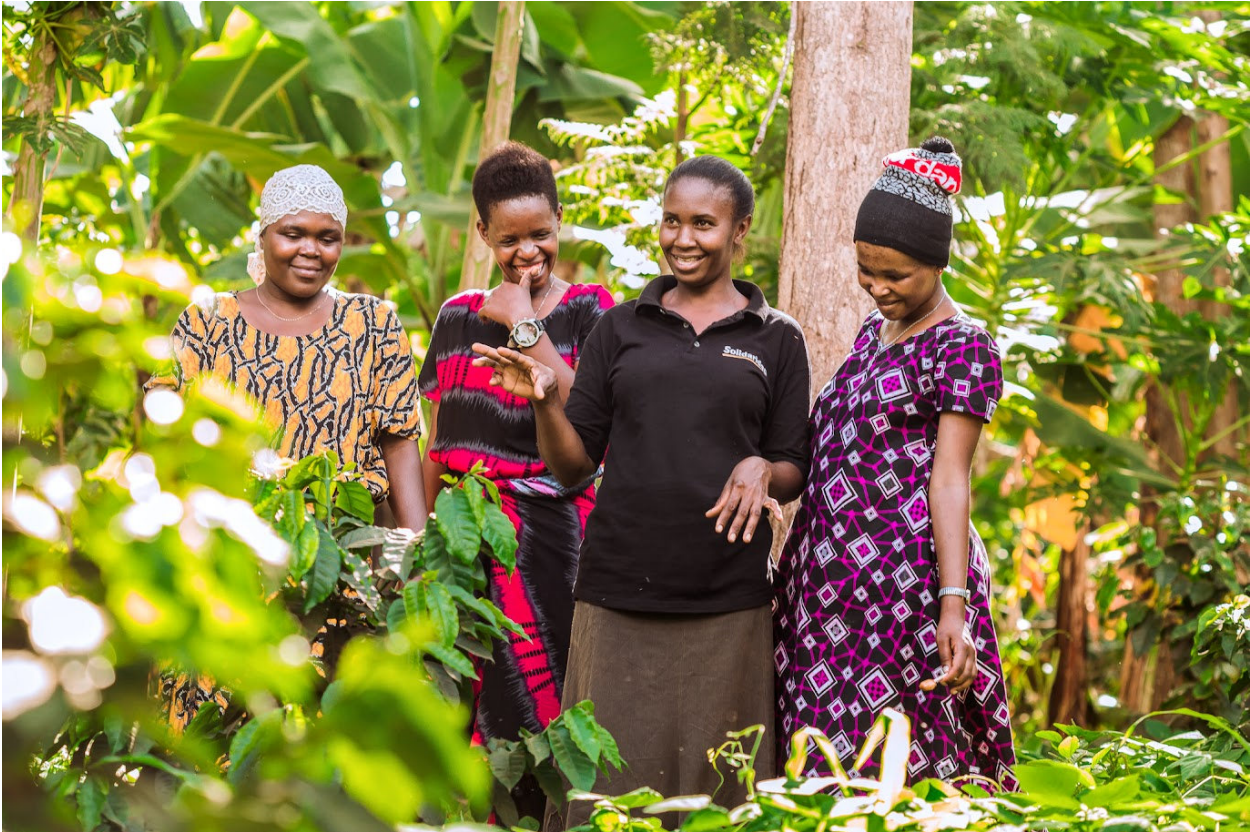
Women and youth in coffee production, Tanzania

Our strategy in Europe is guided by the overall vision and mission of the Solidaridad Network.