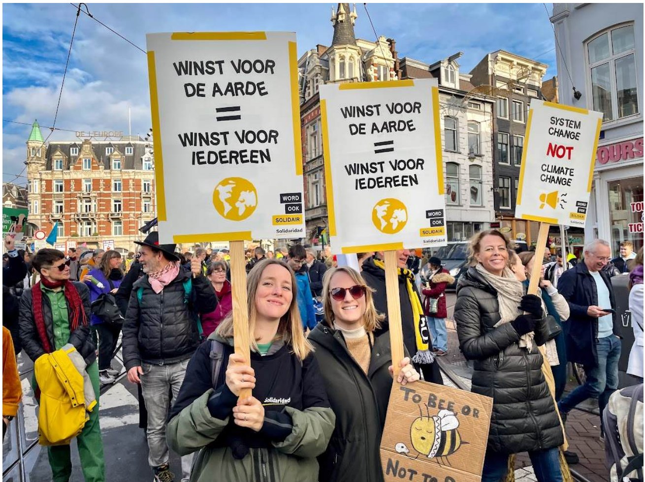
85 thousand people joined the March for Climate and Justice in Amsterdam on 12 November 2023, including some staff of Solidaridad Europe. The march is an initiative of the Dutch Climate Crisis Coalition.

As the world is facing multiple challenges, with a worsening climate crisis; armed conflicts; shrinking civil space and a backlash on human rights and on women's rights, this contributes to growing global inequality and a widening social and political division across various regions.