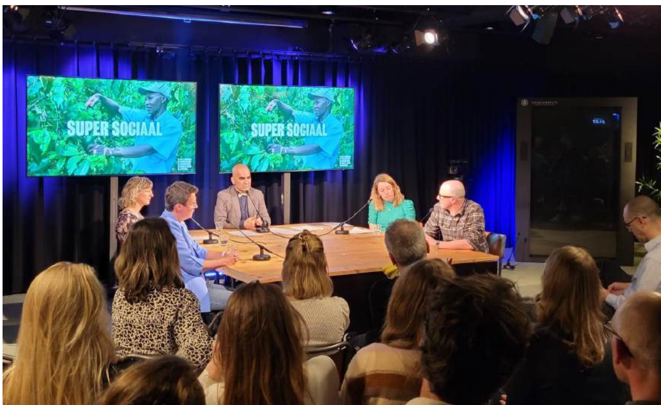
In May 2023, Solidaridad co-organized an event in Amsterdam to discuss the findings from our 'Superlijst Sociaal' supermarket campaign.

Whilst farmers play an essential role in the transition to a carbon-neutral economy and ensuring food security, they should also be paid for their ecosystem services, in addition to the food they produce. Moreover, this is also a win-win for companies interested to invest in this future-proof solution to help tackle climate change.